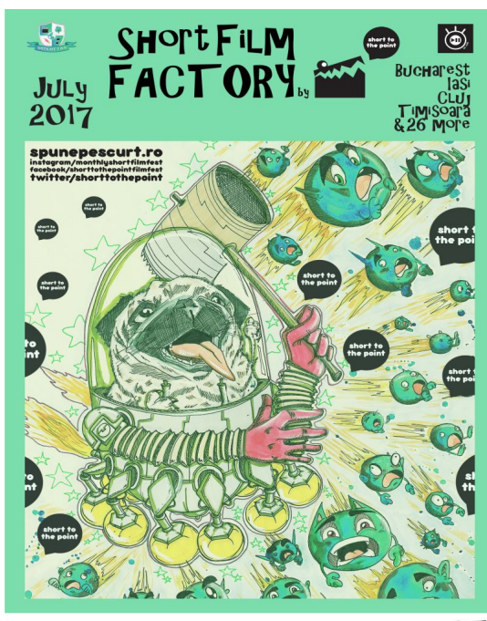
COFFEE 30 IULIE 2017, ORA 19

SHORT FILM FACTORY te invită la film. 10 scurtmetraje premiate anterior în cadrul festivalului Short to the Point (STTP) vor rula în 30 de spații alternative din tot atâtea orașe din țară, în ultima săptămână din luna iulie. 120 de minute de film, povești spectaculoase venite din toate colțurile lumii, continuă o tradiție de peste 8 ani de proiecții speciale, oferind publicului șansa unică de a urmări filme scurte multi-premiate, cu intrare liberă, chiar la el în oraș.